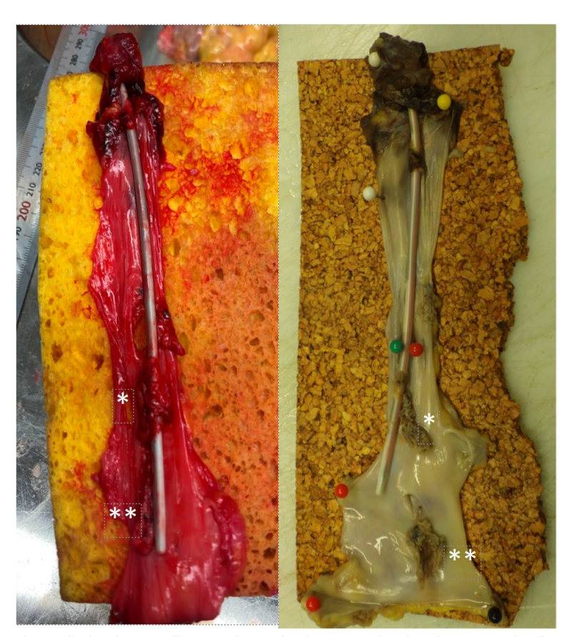
Fig. 1 Macroscopically, thrombi attached to the centrally inserted central catheter (*) and to the adjacent vessel wall (**) were observed in all cases (100%). Photographs were taken before and after formalin fixation