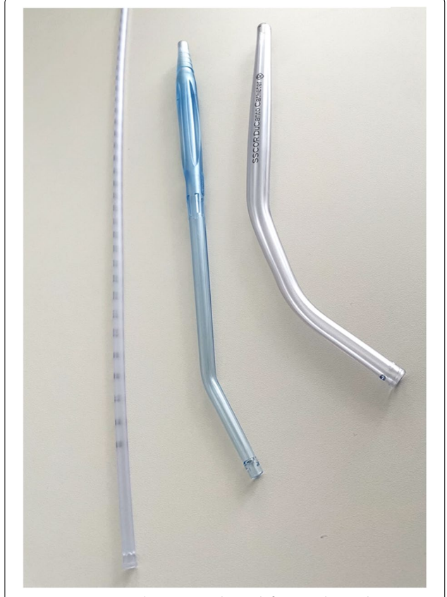
Fig. 1 ConvaTec 14Ch suction catheter (left), Extrudan Yankauer 18Ch suction catheter (middle) and SSCOR DuCanto 28Ch suction catheter (right)

We compared (a) a standard 14 Charrière (Ch) suction catheter (ProFlo with funnel, outer diameter 4.667 mm [Ch 14], length 60 cm; ConvaTec Ltd., Deeside, United Kingdom), (b) a standard large-bore rigid Yankauer suction catheter (Yankauer Midi, outer diameter 6.0 mm [Ch 18], length 27 cm; EXTRUDAN Surgery ApS, Birkerød, Denmark), both of which were in use in clinical daily routine, and (c) the novel SSCOR DuCanto Catheter (DuCanto Catheter with outer diameter 9.3 mm [Ch 28], length 24.9 cm; SSCOR, Inc., Sun Valley, CA, United States of America). Figure 1 shows the suction catheters used. These were connected to a standard suction line used for clinical routine in our hospital (suction line 1.8 m, Ch 25; Ref. 1324.1800.80ML, Extrudan Surgery ApS, Denmark). Negative pressure of the suction unit was set to the maximum, which was -0.8 bar (approx.-600 mmHg).