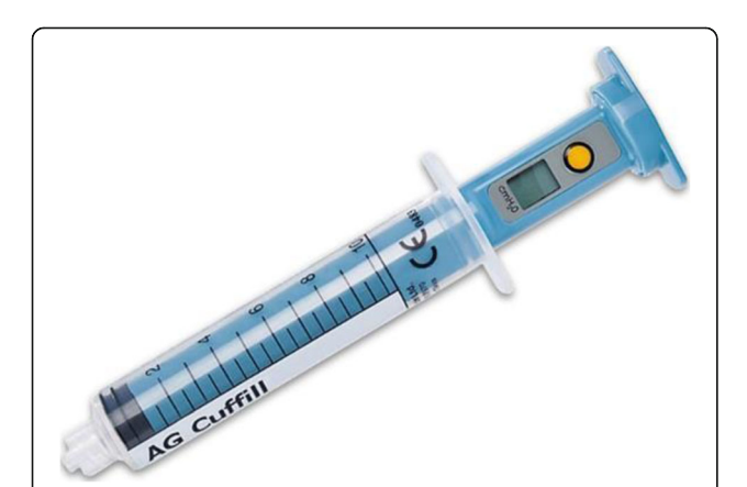
Fig. 1 AG Cuffiill™ Manometry Device. The manometry device (cmH2O) provided for cuff pressure measurement during the post-interventiom phase

An educational module was created and distributed electronically to our anesthesia providers. The module contained pre-test questions and evaluated knowledge of the incidence of POST as well as the recommended ETT and LMA cuff pressures. Information on the reported incidence of POST and recommended cuff pressures was provided, as well as step-by-step text instructions for measurement of cuff pressure with an electronic manometry device (AG CUFFILL™), (Hospitech Respiration, Ltd., Mercury Medical, Clearwater, FL) (Fig. 1). This in-service was followed by a brief instructional video and a link to the manufacturer's instructional video. Changes were made to the electronic medical record (EMR) prompting provider input of ETT and LMA cuff pressures before and after intervention. This built-in