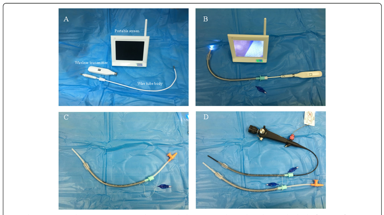
Fig. 1 The Disposcope endoscope (Dexscope<sup>™</sup>, Yangzhou Dex Medical Device Co., Ltd., Yangzhou, China, a ). The depth of wire transfer was premeasured to ensure that the wire tip did not exceed the tube before NTI. ( b ) An aseptic suction catheter (OD, 5.33 mm, TUORen Medical Equipment Co., Henan, China, c and d ) was inserted through the tracheal tube (TUORen Medical Equipment Co., Henan, China) and fibreoptic bronchoscope (Pentax FI-10BS, Pentax Corporation, Tokyo, Japan, d )

General anaesthesia was induced with 1.5-2 mg/kg intravenous propofol and 0.3 \mu \text{g/kg} sufentanil, and