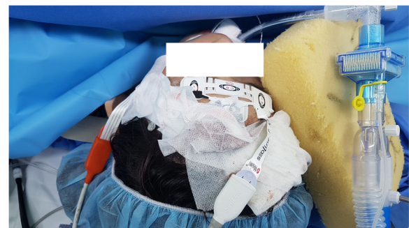
Fig. 1 The application of Entropy and SedLine sensors. To perform additional SedLine EEG monitoring, we moved the Entropy disposable sensor to the upper forehead

No other specific events occurred during the remaining intraoperative period. The patient did not complain of recall in the postoperative period. Upon discharge from the PACU, the last memories the patient had prior to sleep were the events of the surgical time-out just after entering the operating room. The first memory the patient had after awakening was the instruction from the medical staff to open her eyes in the recovery room. The patient did not dream during surgery. Mild surgical pain and dry mouth were the only discomforts the patient complained of in the recovery room.