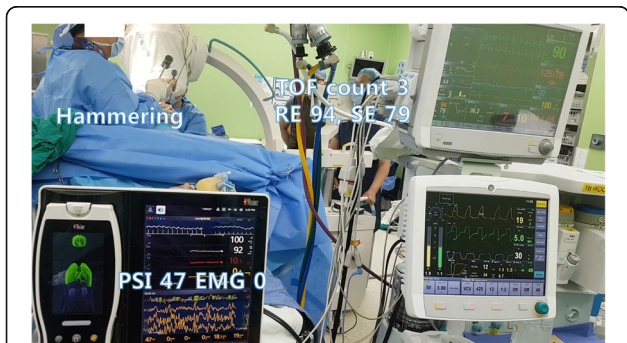
Fig. 3 The second case of unusual elevation on Entropy by use of surgical device (constant hammering), but not on PSI. Ninety-four of response entropy (RE) and 79 of state entropy (SE) were assessed, while 47 of patient state index (PSI) was assessed. Three counts of train of four (TOF) on NMT and 0% of EMG on SedLine were assessed simultaneously

There are some limitations in our case report. First, as shown in Fig. 1, the position of the Entropy sensor was higher than that of the SedLine sensor on the forehead. Prior to attaching the SedLine sensor, the Entropy sensor