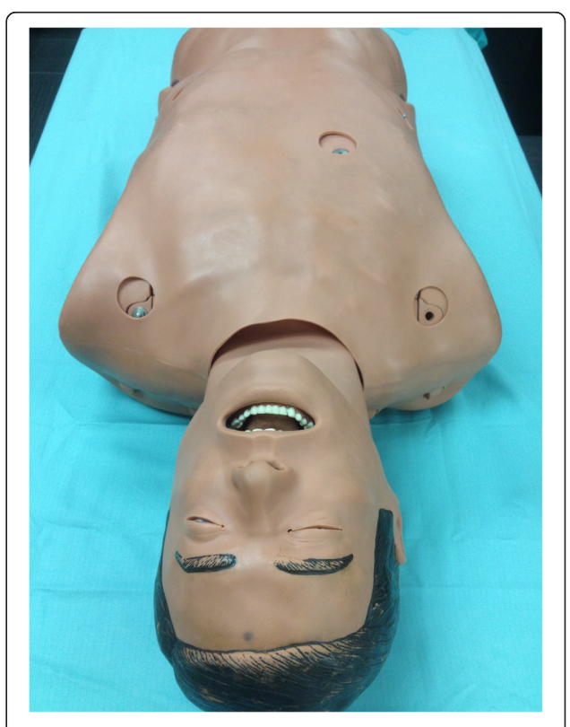
Fig. 1 The Human Airway Anatomy Simulator (HAAS)

On the HAAS, Expert subjects performed bronchial blocker (Arndt Blocker, Cook Medical, Bloomington, IN) and double lumen endobronchial tube (Mallinckrodt, 35Fr, Covidien, Ireland) insertion.